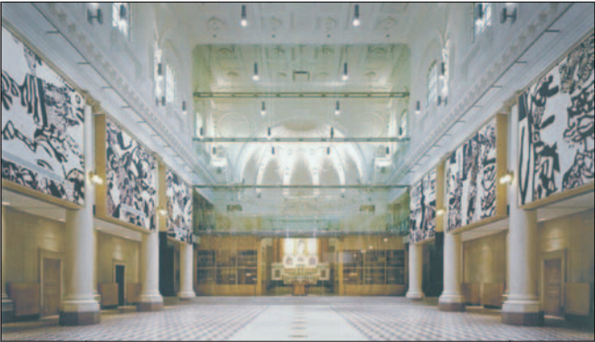
Figure 3: The historic chapel has been converted into a library that houses more than 200,000 books. This retrofit has been done using low temperature fluid for heating equipment that will maximize the recovery of flue gases at the new heating plant.